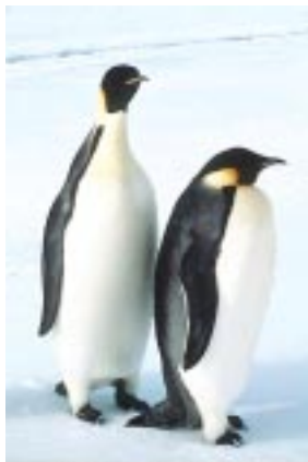
Emperor penguins off shore of Wilkes 1982 Acquired by the Division of Antarctic Research © Commonwealth of Australia

Antarctica (see table), but only the Emperor lives on the ice shelf.